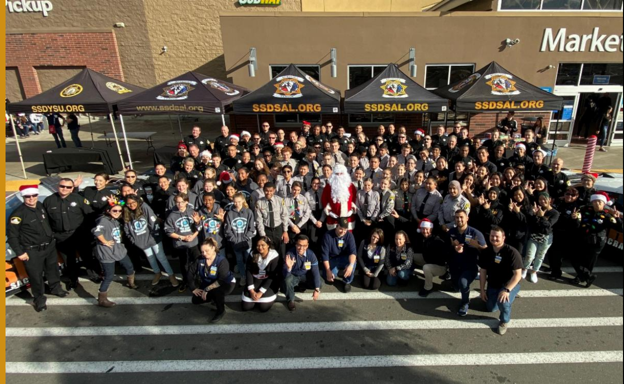
SWAC: WALMART ON ELK GROVE BLVD