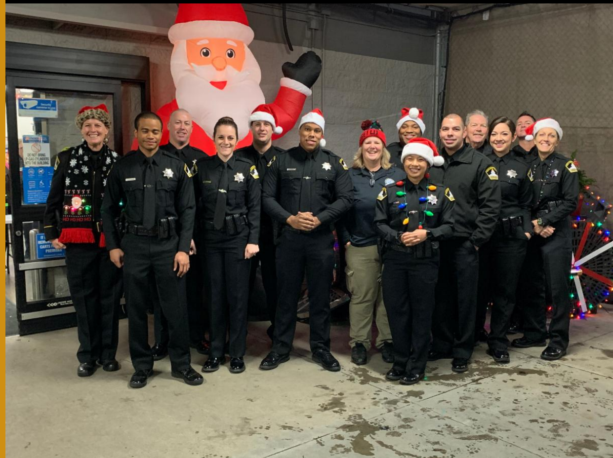
SWAC: WALMART ON WATT AVE AND ELVERTA RD