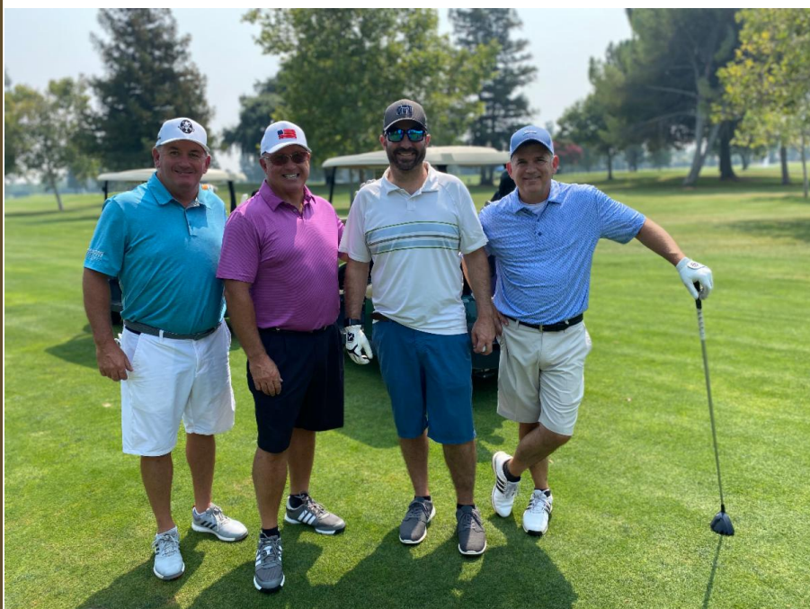
Edges Electrical Group