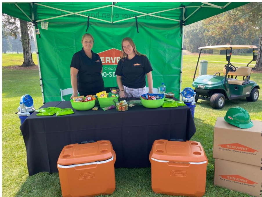
711 Club and Pig Bowl presents Guns and Hoses