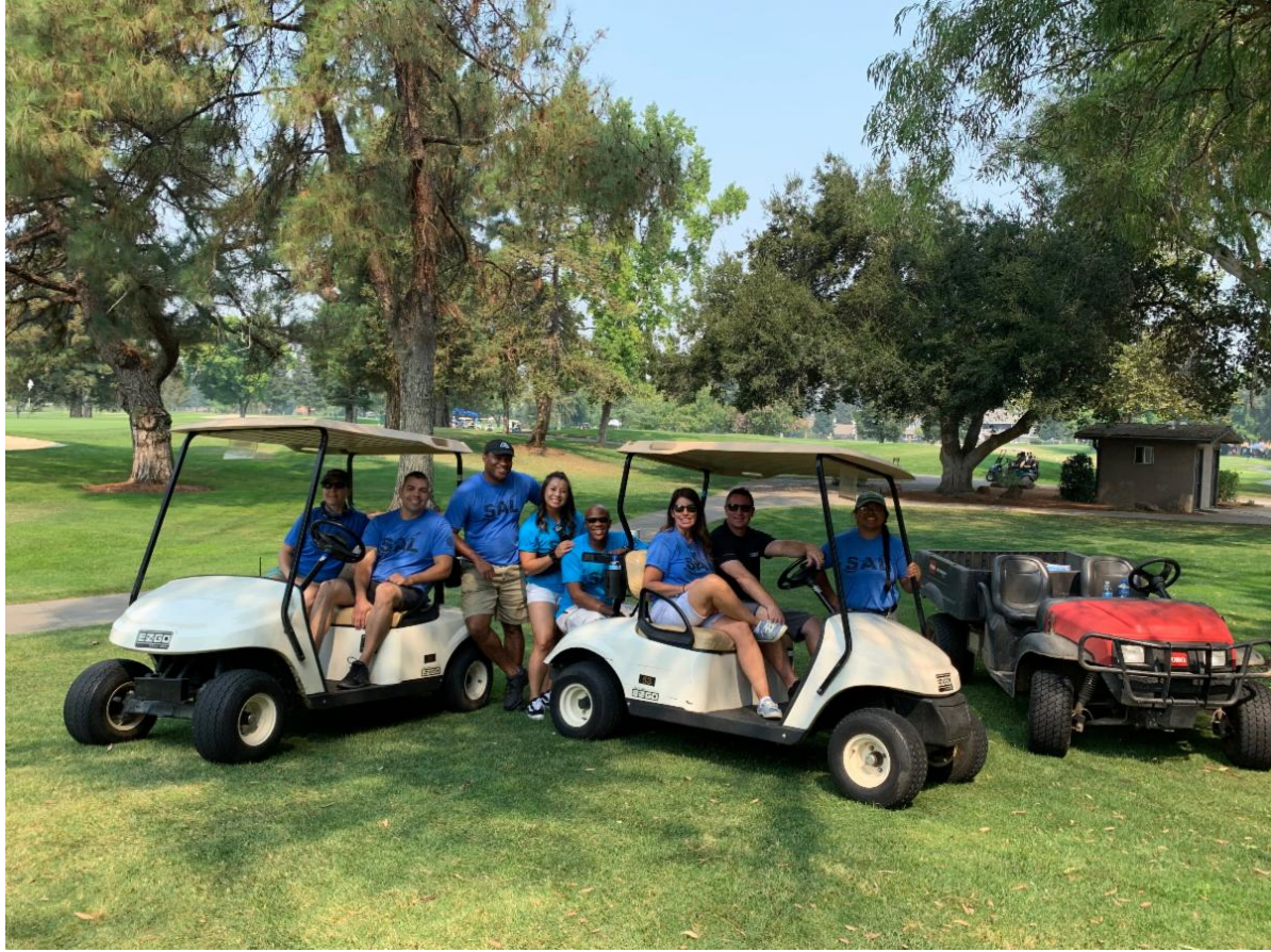
Sacramento County Sheriff's Explorers