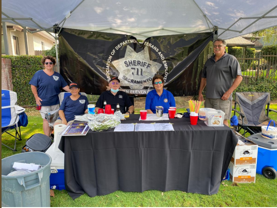
Sacramento County Deputy Sheriff's Association (SCDSA)