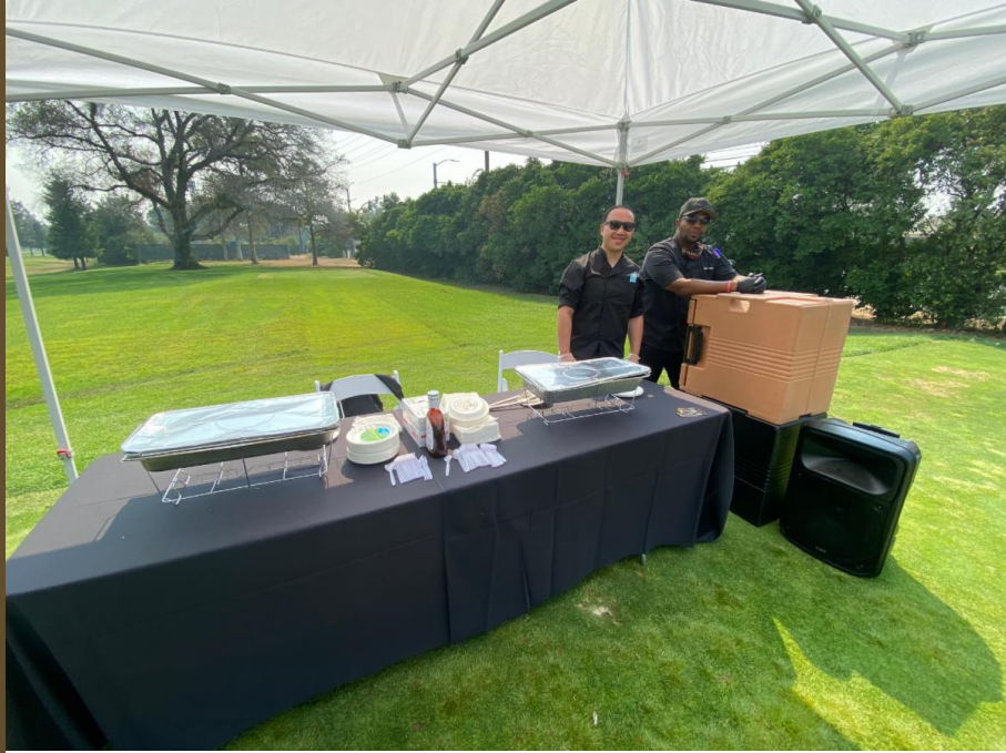
Taste of Tuscany