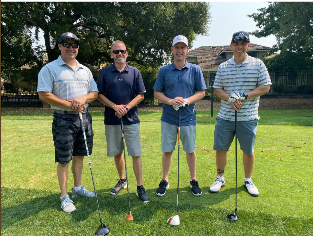
Law Enforcement Management Association