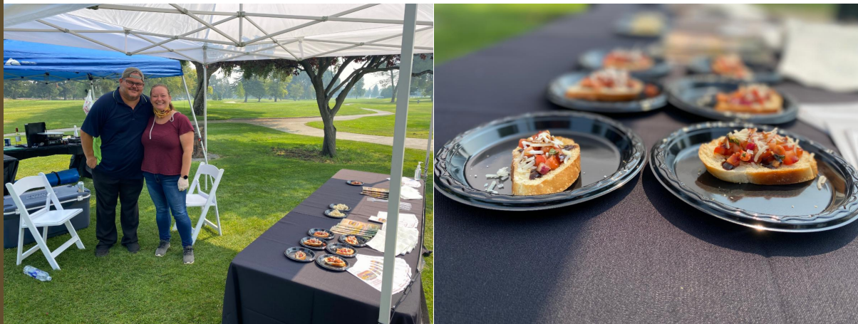
Sheriff's Toy Project