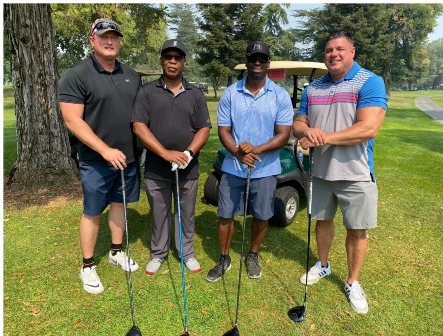
Sacramento County Deputy Sheriff's Association (SCDSA)