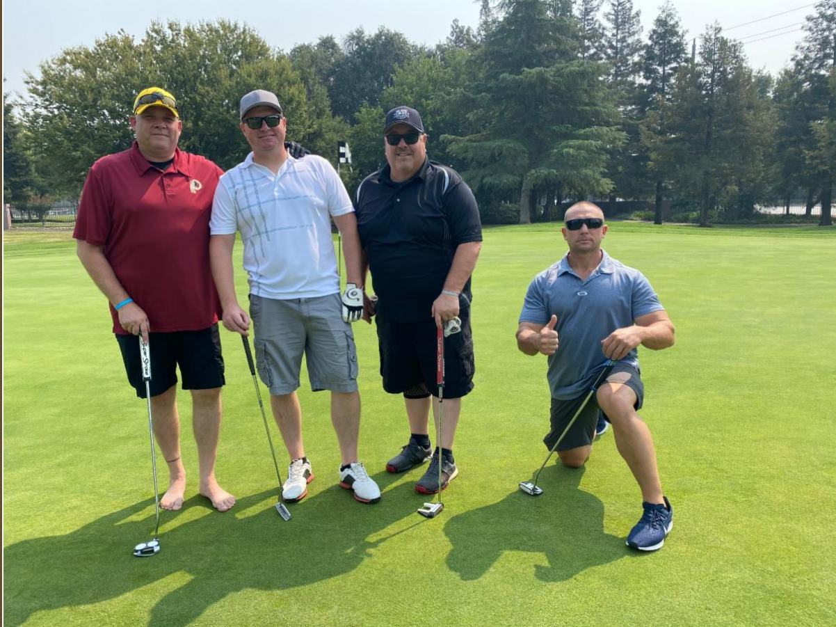
Pig Bowl presents Guns and Hoses