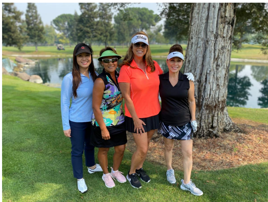
CAHP Credit Union