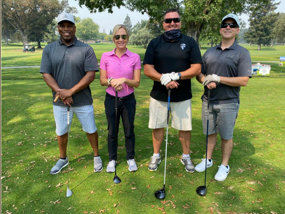
Berco Redwood Inc. & Berry Lumber