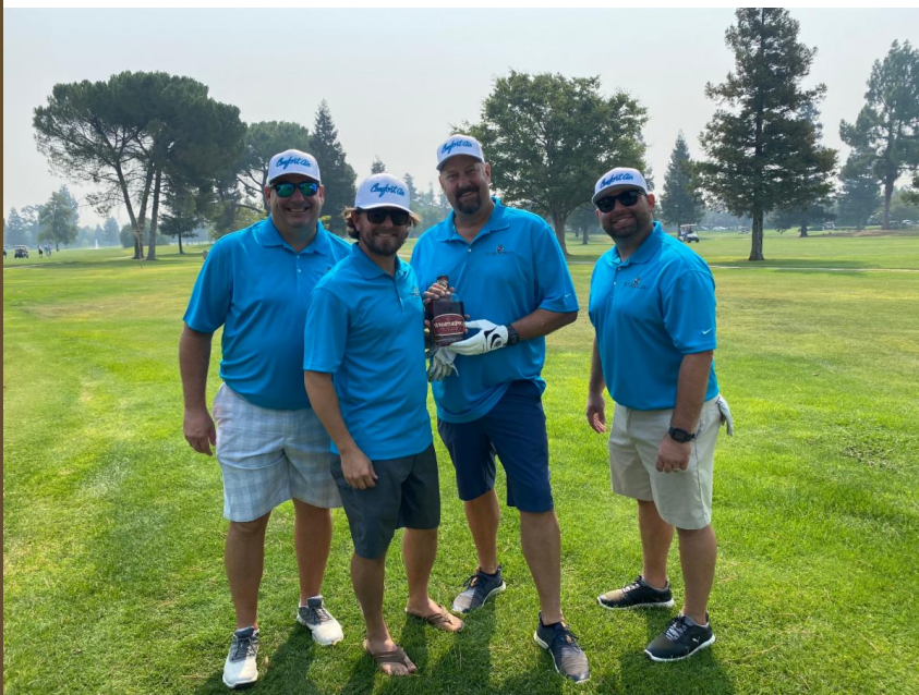
California Embroidery & Design