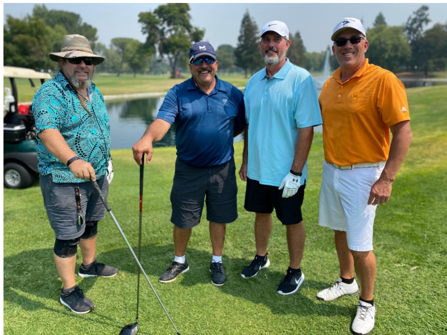
Augustine & Associates- RE/MAX Gold