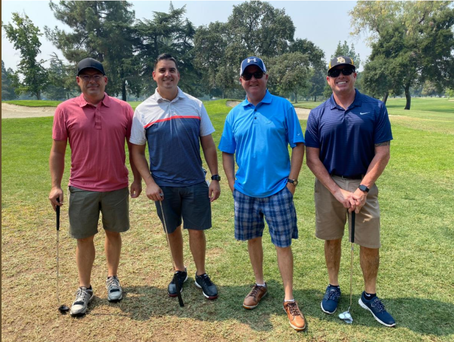
Thank you for your support!