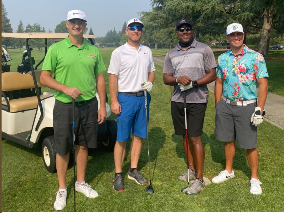
Sierra Vista Hospital