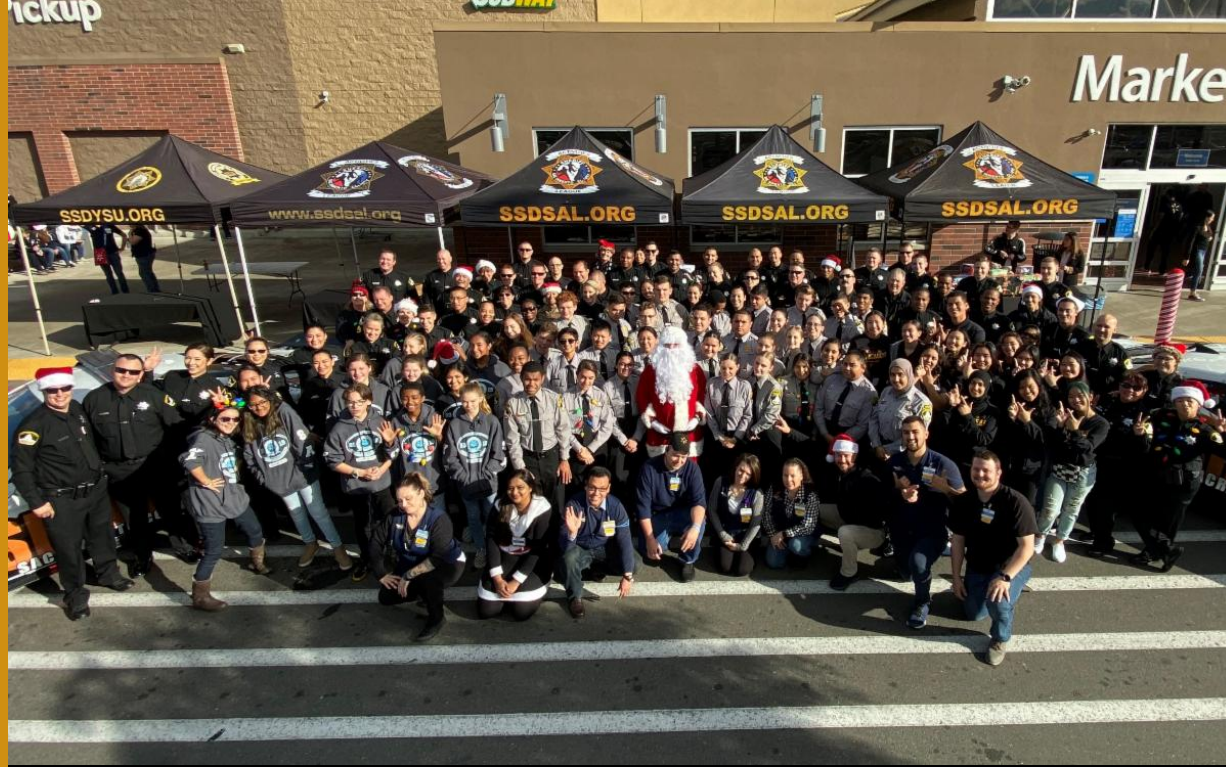
SWAC: WALMART ON ELK GROVE BLVD