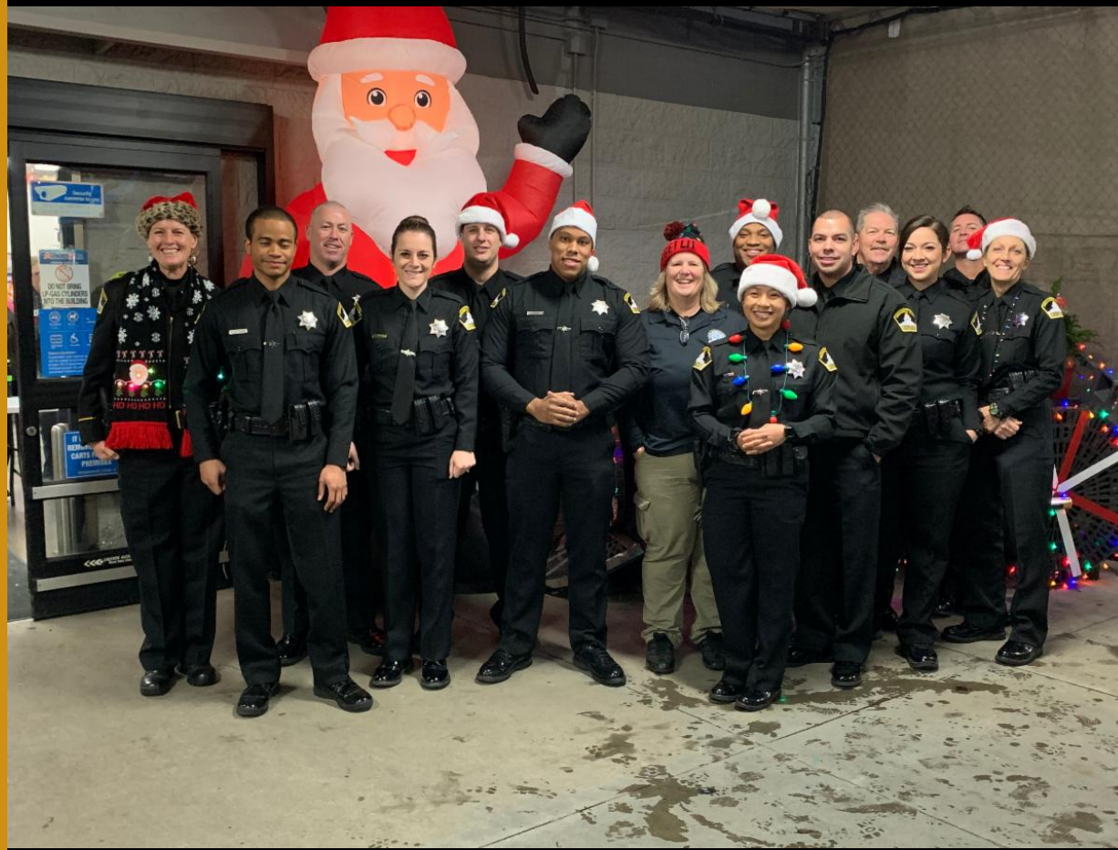
SWAC: WALMART ON WATT AVE AND ELVERTA RD